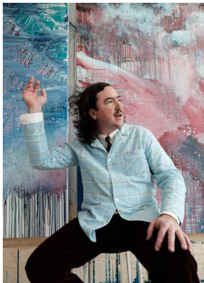
The artist's studio of Jan De Cock is located in the Spinolarei in Bruges. 'This place was originally meant for a new hotel.'